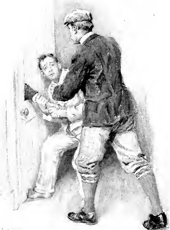
Before he could answer, I had him round the neck.